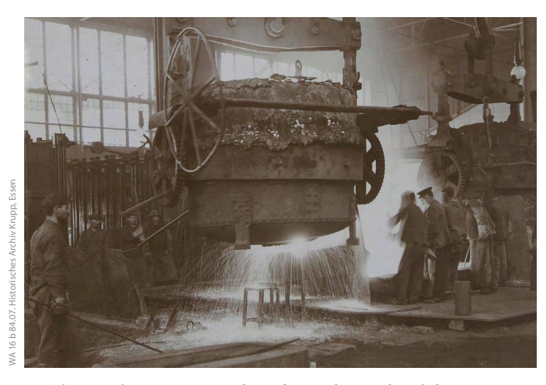
The master's programme provides students with expert knowledge in historical episodes of growth and crises and enables graduates to develop solutions for current issues in economics.