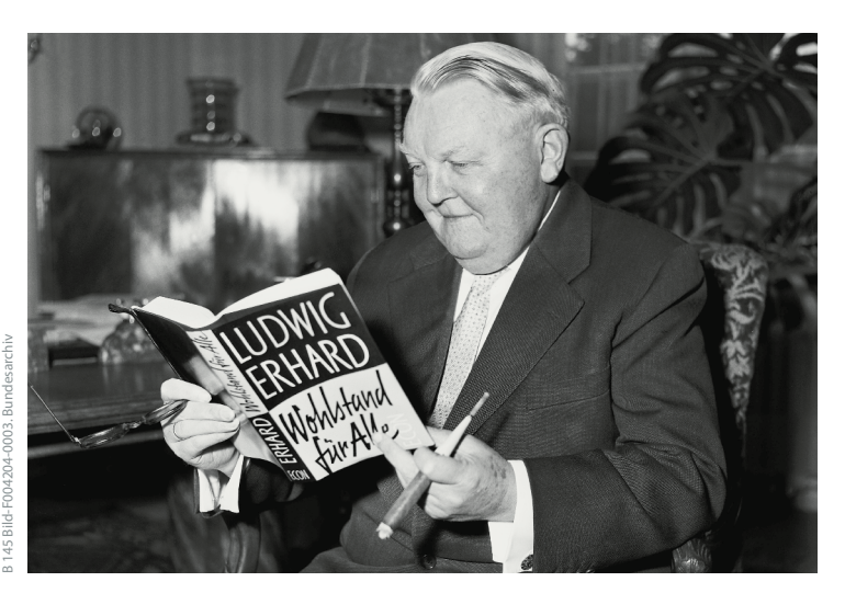
Economic historians with expertise in historical and statistical analysis enrich the research conducted at universities and are highly sought after by companies with strong quality profiles.